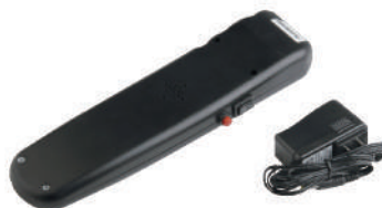
▲ OS0024 RF handheld detection & decoder