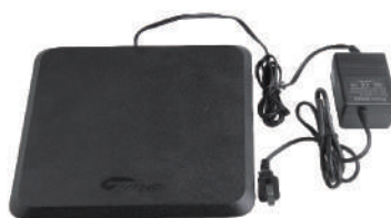
▲ OS0022 RF decoder