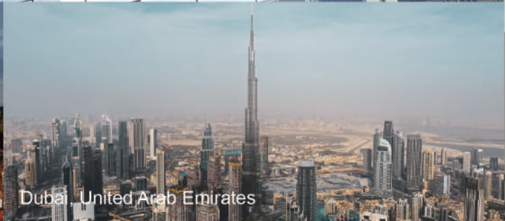
Dubai, United Arab Emirates