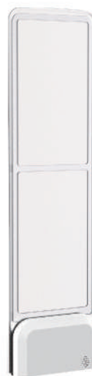
▲ OS0215 AM MONO