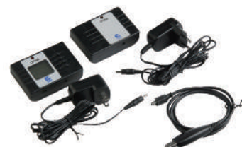
▲ OS0039 Passenger flow counter