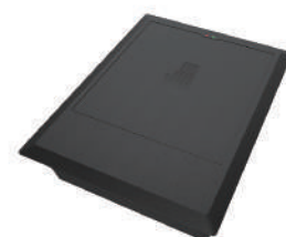
▲ OS0143 AM decoder